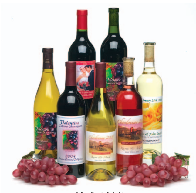
Wine Bottle Labels!

The LX810 produces gorgeous, professional-quality labels for all your short-run, specialty products. It is also perfect for a host of other uses such as proofing before going to press on longer runs. Test marketing. Contract manufacturing. Private label goods. Promotional labels. Full-color box-end labels with all the required bar codes. And much more!