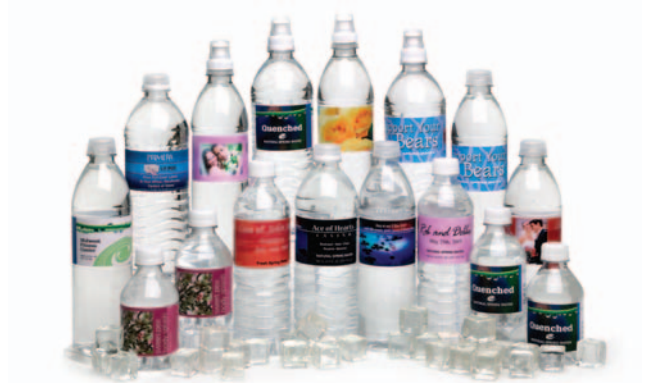
Water Bottle Labels!

LX810 prints onto many different label and tag materials, including inkjet coated high-gloss, semi-gloss and matte labels. Labels printed on high-gloss material are highly scratch- and smudge-resistant and virtually waterproof. This is a perfect solution for primary or box labels that can be exposed to water, rain and snow.